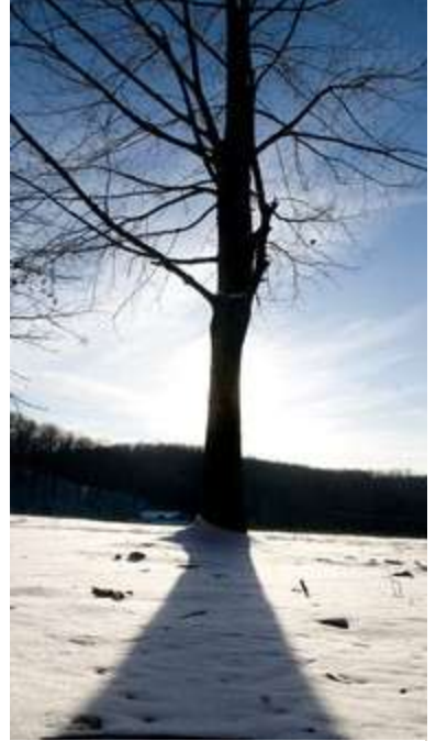
Lake Linganore is the focus of a program this spring that encourages residents to plant trees to help slow the buildup of sediment in the reservoir.