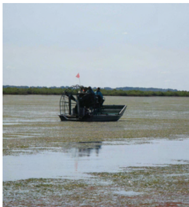
Figure 5. Hydrilla infestation on an 8–10 foot deep Lake Tohopekaliga in Central Florida.

In the absence of other structure, hydrilla presence can provide habitat and food resources for fish and wildlife and has been associated with quality largemouth bass populations. Hydrilla also provides quality nursery habitat for juvenile fish. However, high hydrilla coverage can reduce fishing efforts because it can pose difficulties for angler access, may cause fish growth rates to decline, and represents a risk to fish populations