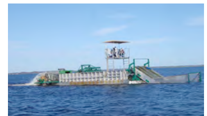
Figure 6. An application of aquatic herbicide using an airboat with trailing hoses for treating hydrilla. Note: Filamentous algae is on the water's surface and hydrilla is below.

shred, crush, press, lift, convey, transport, and remove aquatic plants and associated organic material from water bodies. Specially designed machines called mechanical harvesters or aquatic plant harvesters are used to physically remove hydrilla. These machines cut the stems of the plants, convey them to a holding area on the harvester, and then transport the plant material to additional equipment on the shore for disposal (Figure 8). Mechanical removal is mainly used for hydrilla management when hydrilla is close to domestic water supply intakes, in rapidly flowing water, or if immediate removal is necessary. Using mechanical control of hydrilla on large lakes without the use of herbicides or other control methods has not been feasible because of the high cost, its short-term effects, logistical constraints, and other considerations.