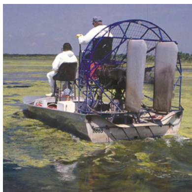
Figure 6. An application of aquatic herbicide using an airboat with trailing hoses for treating hydrilla. Note: Filamentous algae is on the water's surface and hydrilla is below.

Endothall-containing products are now the most widely used herbicides for large-scale hydrilla management in Florida. Endothall is a contact herbicide and requires only 12–72 hours exposure time (depending on concentration of the herbicide in the water) to be effective. Traditional use patterns of endothall included small-scale applications for access, navigation, and treatment of new