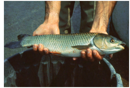
Figure 6. An application of aquatic herbicide using an airboat with trailing hoses for treating hydrilla. Note: Filamentous algae is on the water's surface and hydrilla is below.

Mechanical control refers to the use of machinery designed to cut, shear,