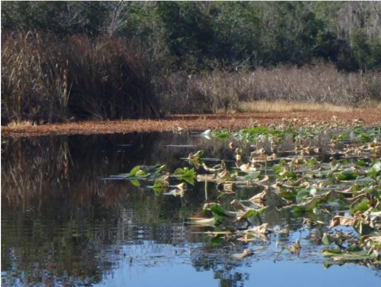
Photo: Treated lilies, water hyacinth, and cattail.

The secchi reading (water clarity) in Lake Waumpi was visible on bottom in a depth of 3 feet. No triploid (sterile) grass carp fish were observed.